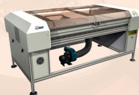
Summa Laser FB1500 206x126cm 30~200W