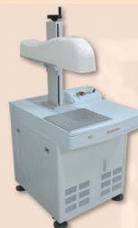
Fiber laser STF1010 10x10cm 30W