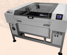
Summa Laser FB700 151x126cm 30~100W