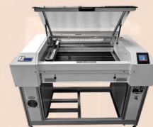
Summa Laser FB500 138x81cm 30,50W